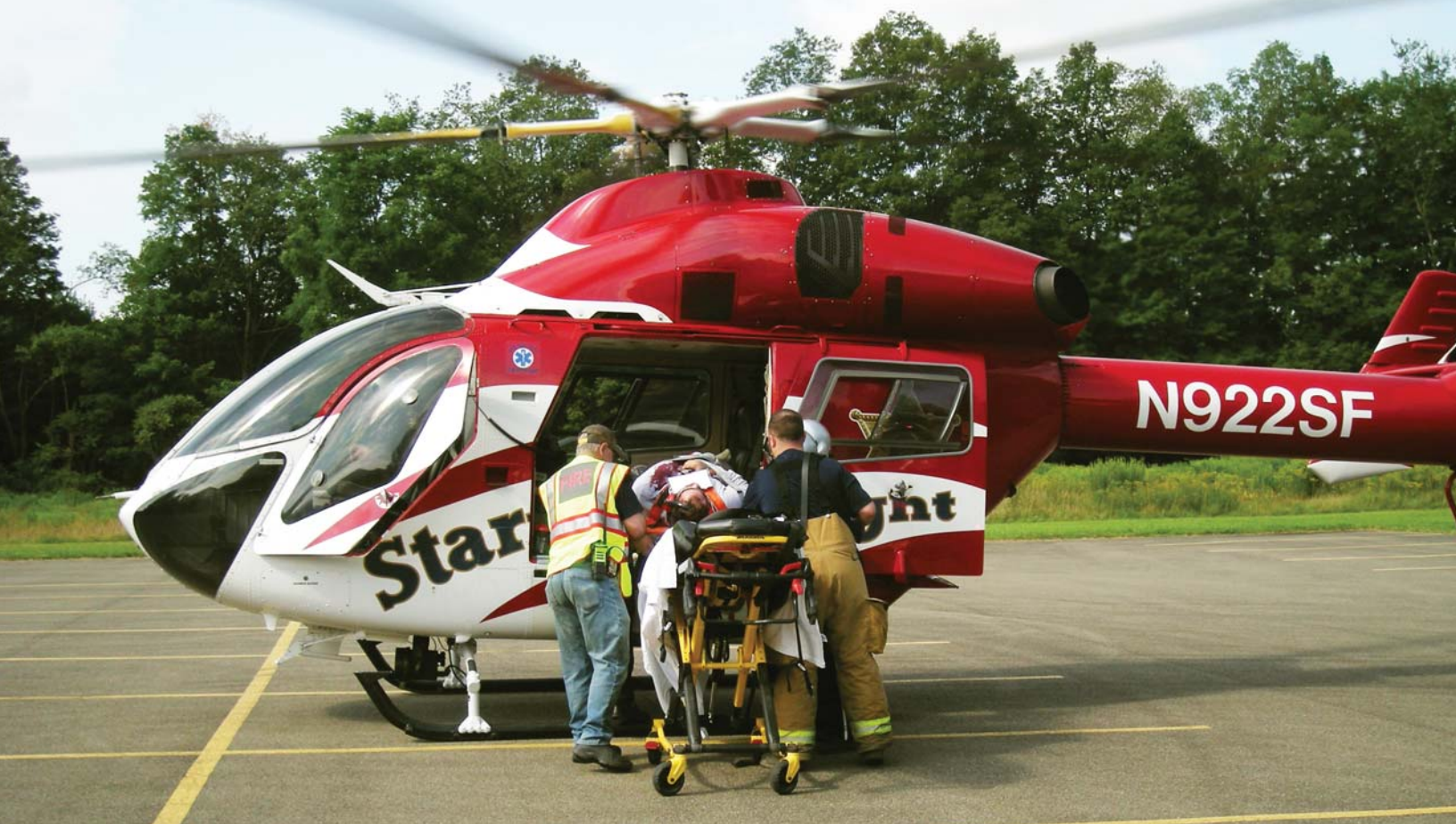
A "victim" from the mock disaster drill, held by five local volunteer fire departments, is loaded into the Starflight helicopter for transport.

GERRY – Five area volunteer fire departments, along with the Starflight helicopter and the Chautauqua County Office of Emergency Services, recently combined for a mock disaster drill that revolved around a "make believe" collapse of the bleachers at the Gerry rodeo grounds. Approximately 50 EMS and fire department volunteers from Gerry, Fluvanna, Ellington, Falconer, and Sinclairville arrived on the scene within minutes of notification with more than a dozen emergency vehicles, including an ambulance from each department to treat 20 "victims" whose injuries ranged from cuts and bruises to broken bones to a fatality.